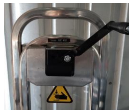
Ratchet with backstop