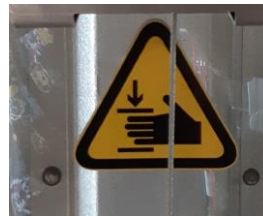
Transparent plexiglass plate to protect the hands and other body