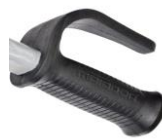
12337 Ergo handgrip with knuckle protection