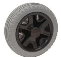
10189 Puncture proof tyre (foamed polyurethane)