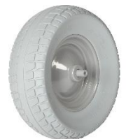
17044 M-800-CT WB extra wide