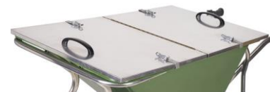
10417 M-COVER NOKA 160 Aluminum (optional)