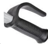
12337 Ergonomic natural rubber handgrip with knuckle protection